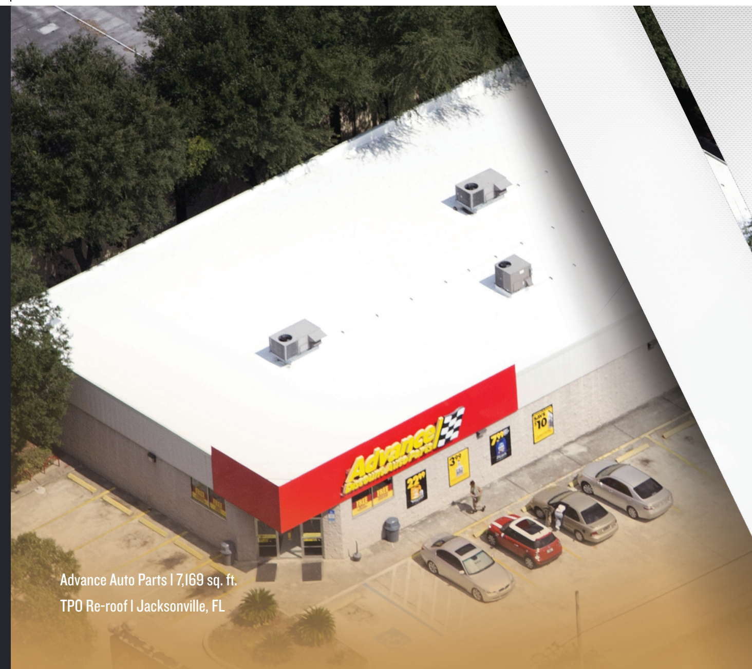
Advance Auto Parts | 7,169 sq. ft. TPO Re-roof | Jacksonville, FL

Call your local roofing experts, North American Roofing, today.